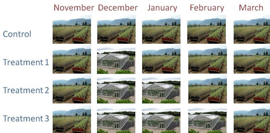
Fig. 1 Suppl. The graphical outline of the experiment. Potted olive plants were either grown outdoors under ambient temperature or transferred into a greenhouse for one, two, or three months during winter.